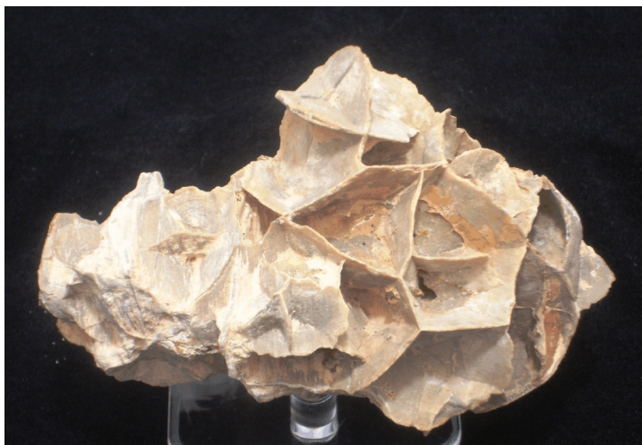
Figure 1. Melikaria, about 3.5" across and 2" high for $40.

Melikaria , Julimes County, Chihuahua, Mexico. We first saw these strange-looking specimens (also spelled "melicaria") at a show more than a few years ago, a new find at that time from Mexico. From what little information that was available, it seems they are "a quartz cast after the crack-filling of a septarian nodule or possibly after a similar crack-filling spherulite," according to former Smithsonian curator John S. White. We were thinking of featuring them in our Club, and actually set up a page on our web site to get opinions from Club members! But it turned out to be a moot point, as we were not able to get enough specimens to be able to feature it.