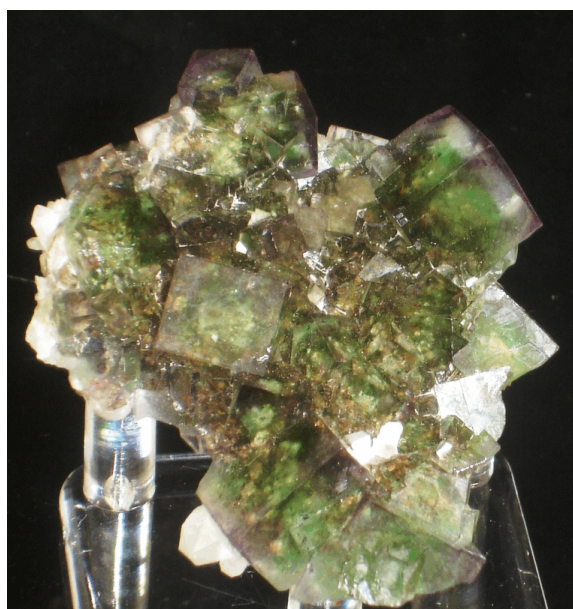
Figure 2. Fluorite cluster about 2.75 tall for $30.

Fluorite , Okoruso Mine, Otjiwarongo Region, Karibib District, Namibia. A smattering of these beautiful clusters has been available the last few years, and usually at very high prices. You can get an idea of their beauty from the photo, although the crystals are actually a deeper shade green, with, as you can see, some purple around the edges! These fluoresce purple in longwave UV light, but don't react to shortwave UV. The clusters are about 3" by 2" and slightly larger, for $25, $30, and $40, according to crystal size.