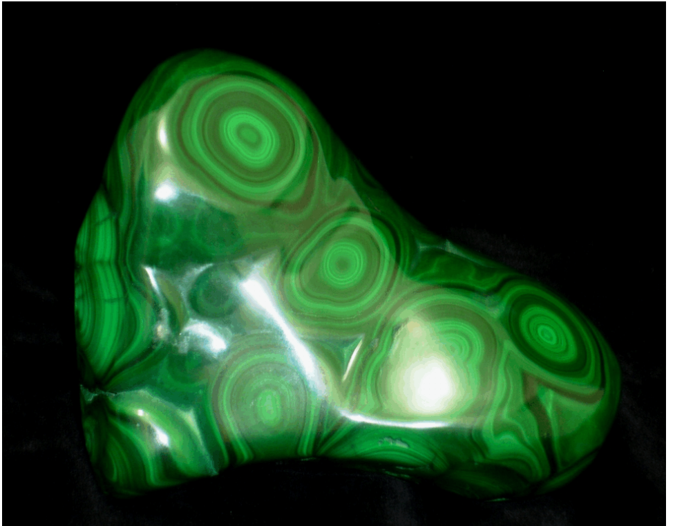
Figure 5. Two views of the same amazing piece, about 4.5" wide and 3" high for $160.